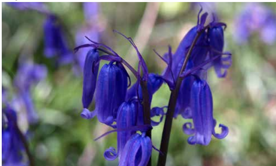
Bluebells in Inholmes Wood

We celebrate Palm Sunday on 13th April this year. We too shall gather in Warnford Churchyard at 9.30am and Commemorate the Lord's entry into Jerusalem with Palm fronds and crosses and singing joyfully. We shall then make our way, equally joyfully, to West Meon for our service at 10.30am. Just as the mood of the crowd changed, so too will the tone of the Liturgy, changing from triumph to hearing St Luke's account of Jesus' Passion – his mental suffering after the Last Supper, his arrest and verbal and physical abuse at the hands of the Temple authorities and the Romans and his Crucifixion.