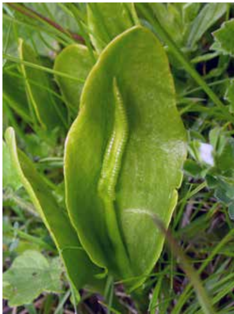
Ophioglossum vulgatum (Adder's tongue fern)